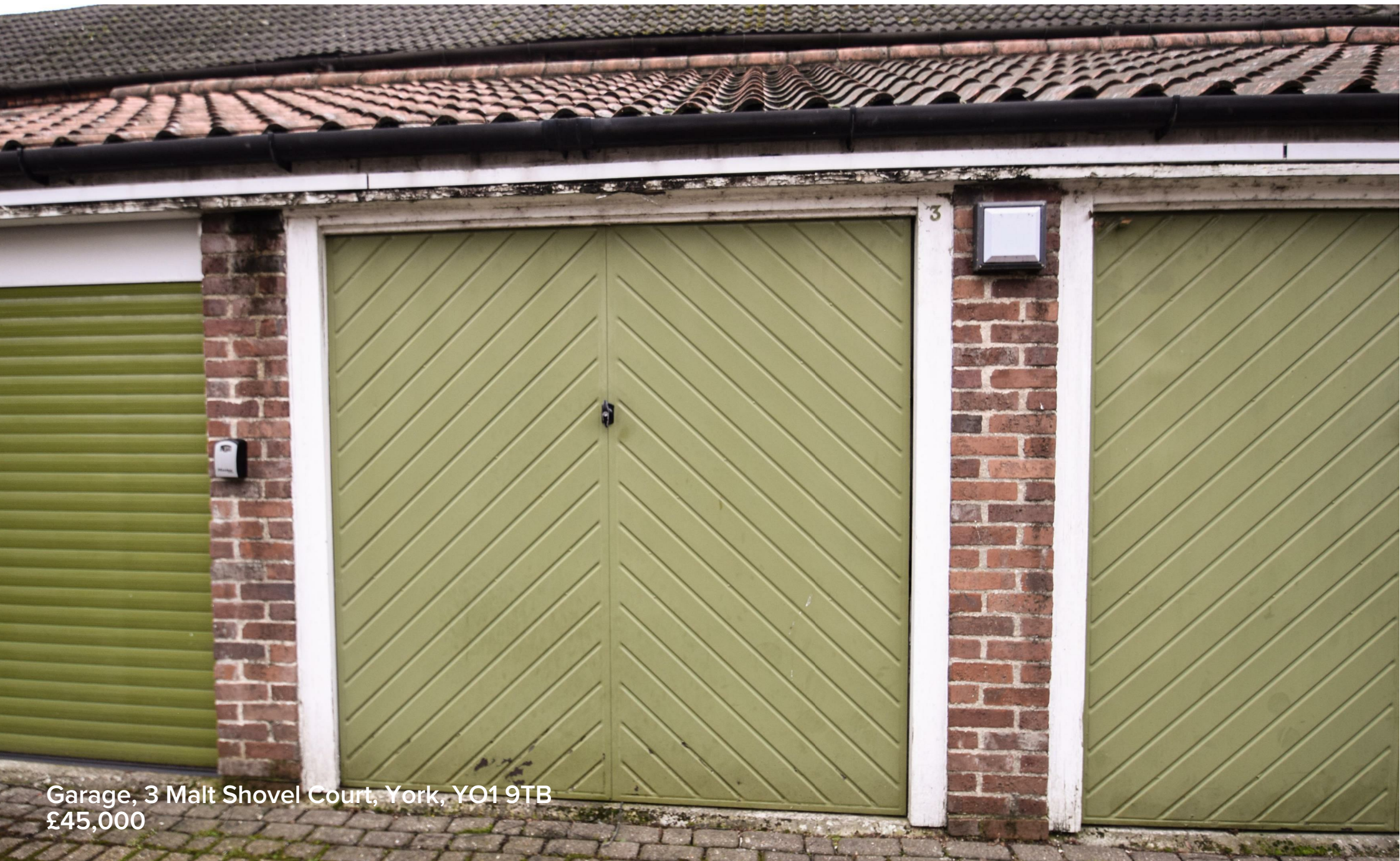
Garage, 3 Malt Shovel Court, York, YO1 9TB £45,000